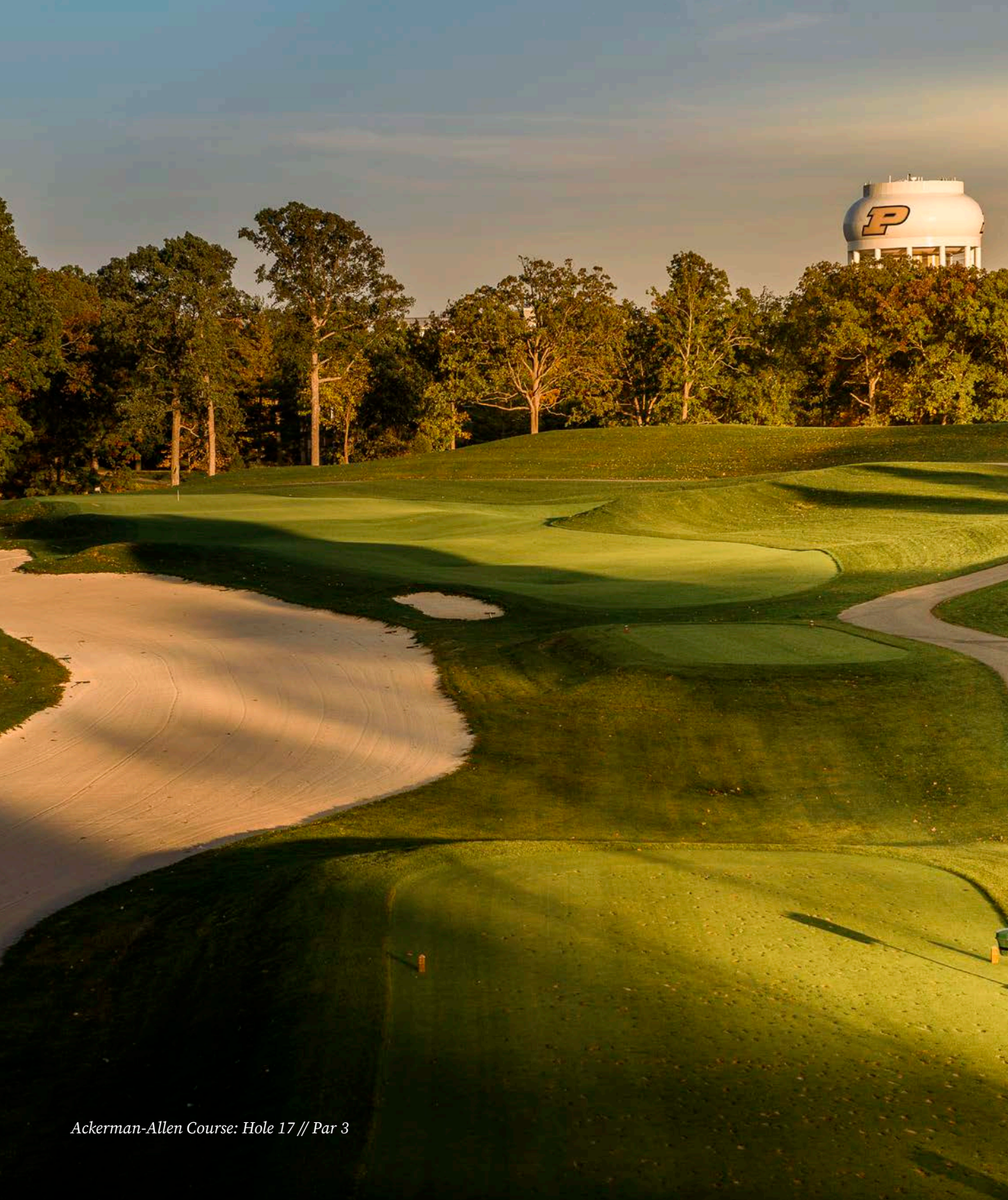
Ackerman-Allen Course: Hole 17 // Par 3

Dear Potential Birck Boilermaker Golf Complex Member,